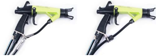
HR: High Resistivity (paint) with Quick Disconnect